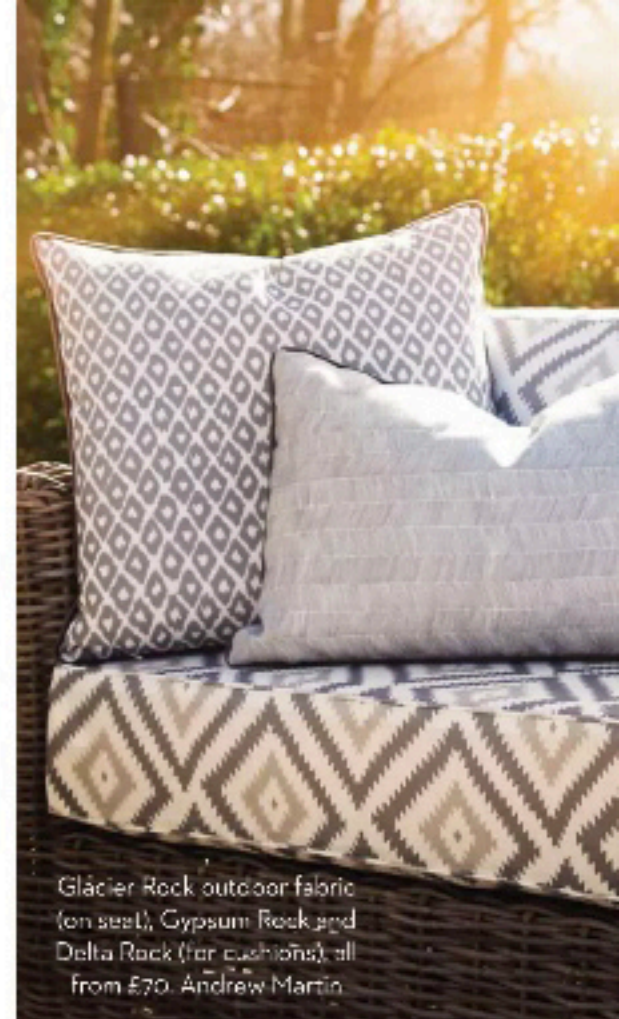
Glacier Rock outdoor fabric (on seat), Gypsum Rock and Delta Rock (for cushions), all from £70. Andrew Martin