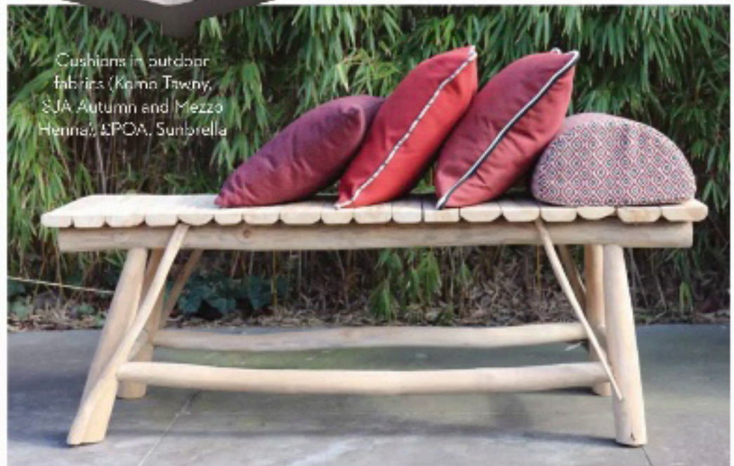
Cushions in outdoor fabrics (Kama Tawny, SJA Autumn and Mezzo Henna), LPOA, Sunbrella