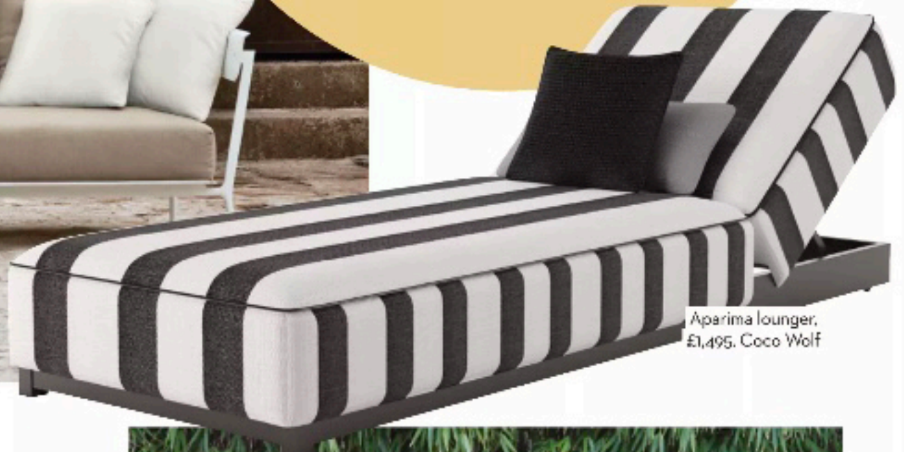
Aparima lounger, £1,495, Coco Wolf